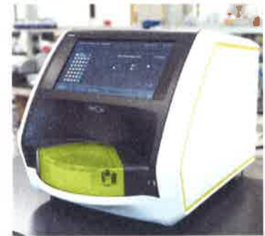
Data below represents results generated on the Quanterix SR-X™ Ultra-Sensitive Biomarker Detection System