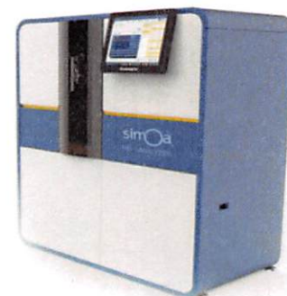
Data below represents results generated on the Simoa™ HD-1