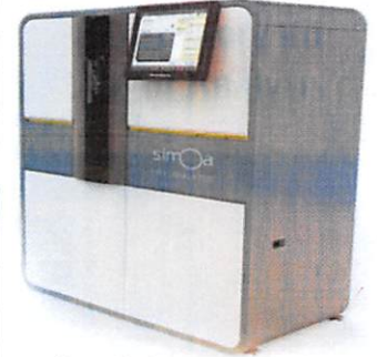
Data below represents results generated on the