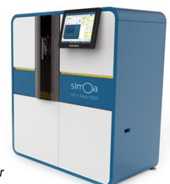
Simoa HD-1 Analyzer

Representative data. Individual results may vary depending upon samples tested and protocols followed.